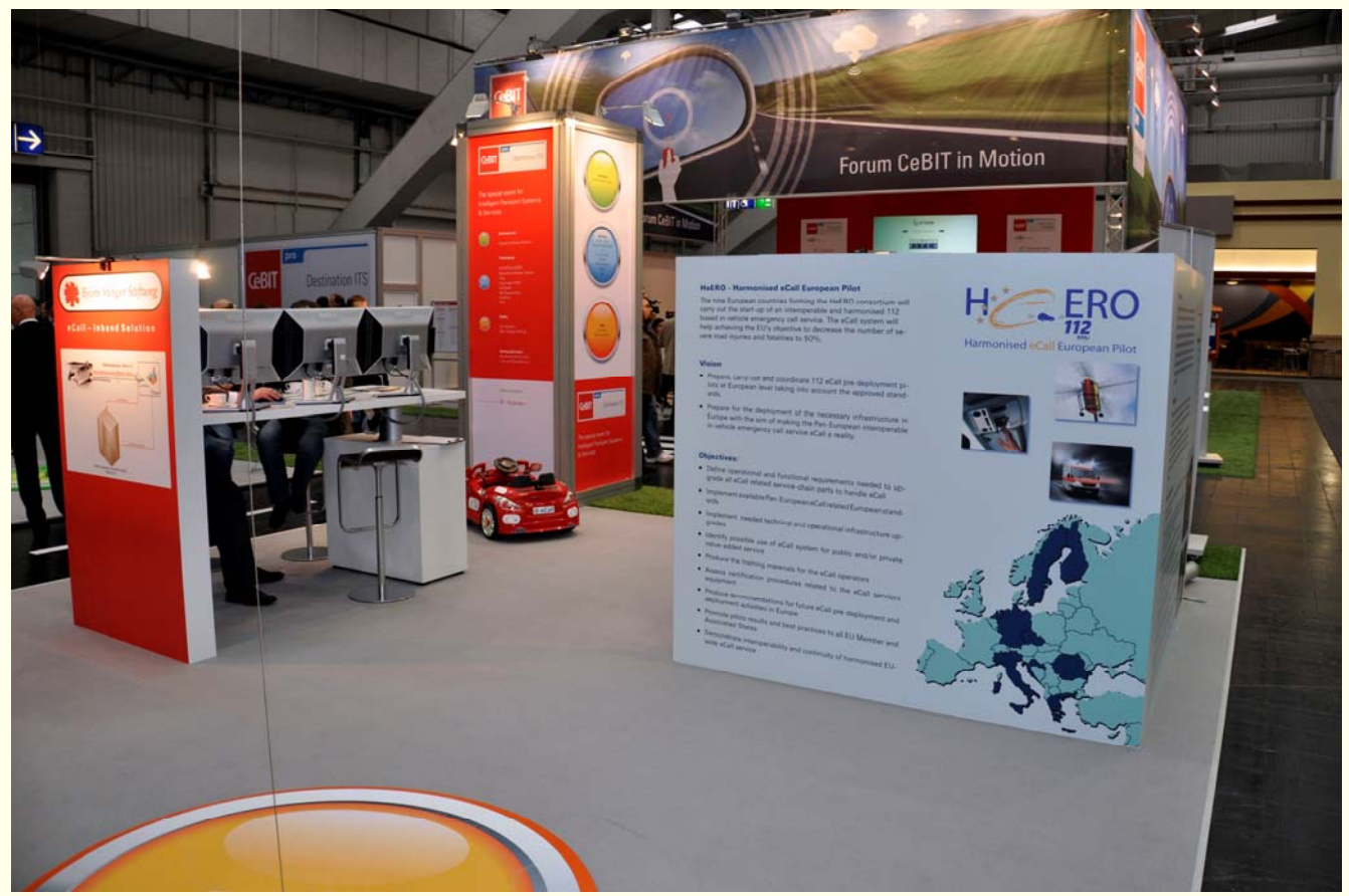
HeERO booth (right) and Björn Steiger Stiftung booth (left)

HeERO - Harmonised eCall European Pilot The nine European countries forming the HeERO consortium will carry out the start-up of an interoperable and harmonised 112 based eCall related service chain parts to enable eCall. The eCall system will help achieving the EU's objective to decrease the number of serious road injuries and fatalities to 50%. HeERO 112 Harmonised eCall European Pilot Vision Prepare, carry out and coordinate 112 eCall pre-deployment goals at European level taking into account the approved standard. Prepare for the deployment of the necessary infrastructure in Europe with the aim of making the Pan-European interoperable in-vehicle emergency call service eCall a reality. Objectives Define operational and functional requirements needed to support all eCall related service chain parts to enable eCall. Implement available Pan-European eCall related European standards. Implement needed technical and operational infrastructure options. Identify possible use of eCall system for public and/or private value added service. Produce the training materials for the eCall operators. Assess qualification procedures related to the eCall services deployment. Provide recommendations for future eCall pre-deployment and deployment activities in Europe. Provide pilot results and best practices to all EU Member and Associated States. harmonise interoperability and continuity of harmonised EU-wide eCall service.